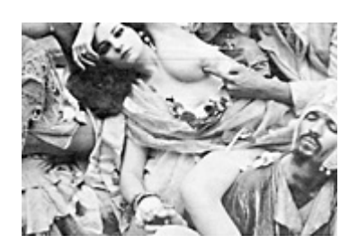
Jack Smith, Flaming Creatures (still), 1963