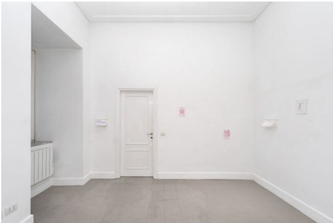
Installation view, Davide Stucchi con Corrado Levi , Zazà, Naples

In the following conversation, Davide and Corrado talk about their respective most loved artworks and their latest collaboration for the show at Zazà in Naples.