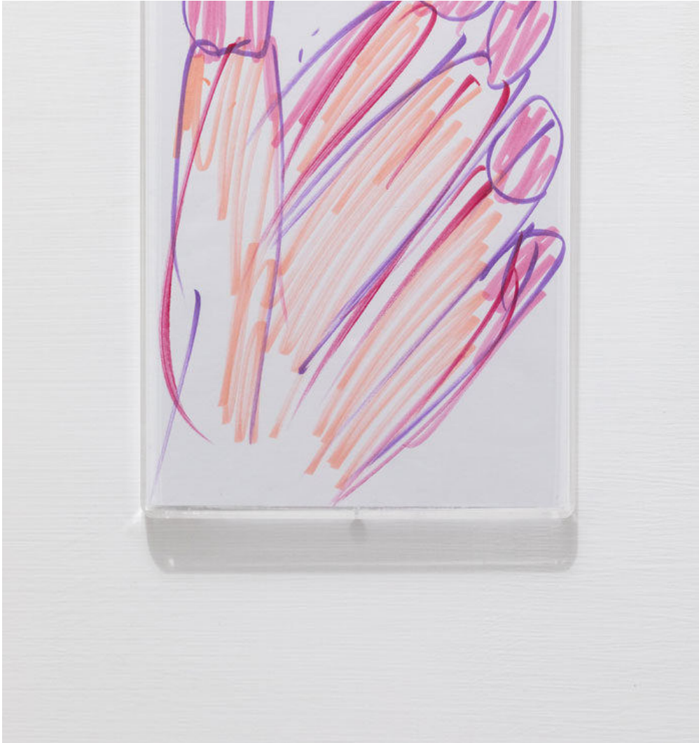
Davide Stucchi, Untitled , 2013. Felt-tip pen on paper, acrylic frame.