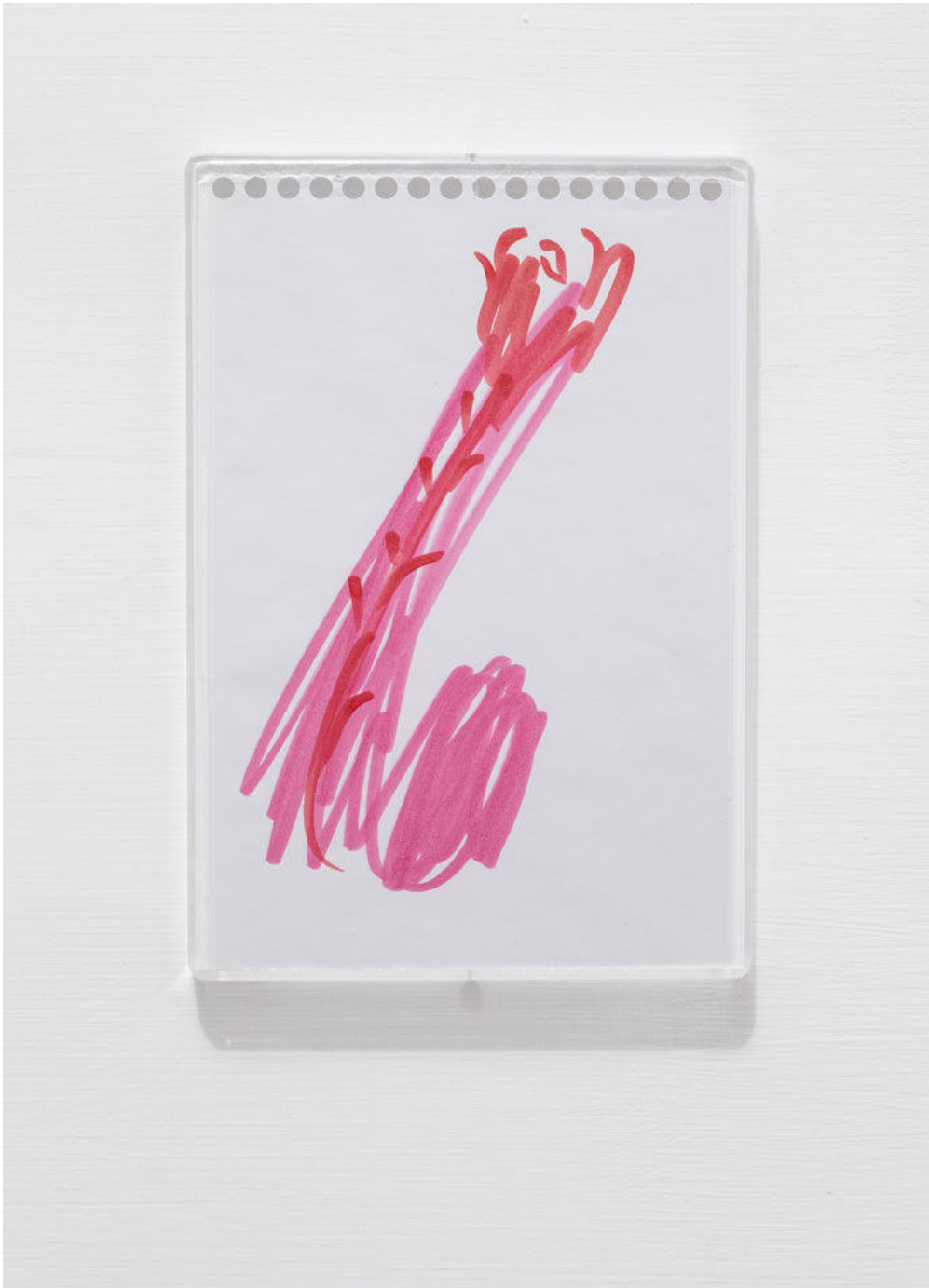
Davide Stucchi, Anacapri , 2013. Felt-tip pen on paper, acrylic frame.