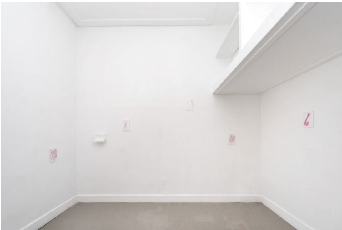
Installation view, Davide Stucchi con Corrado Levi, Zazà, Naples

Davide: Last time I visited your place to show you the folder with my erotic drawings, we were sitting in the living room, and I had to think of your personal version of Cicognino (the famous Franco Albini's stork shaped table), to which you