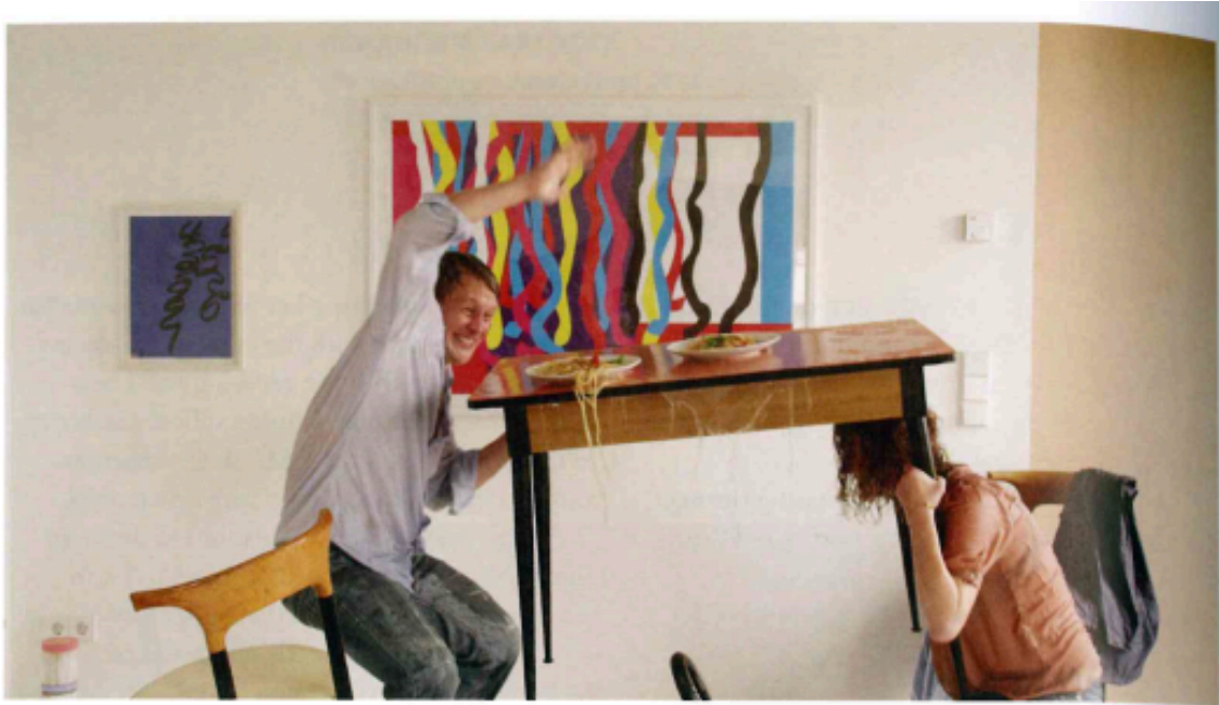
Judith Hopf, "Lily's Laptop," 2013, film still

struggles against machines. We can only summarize that it's still yet to be determined if artificial intelligences can develop a sense of humor.