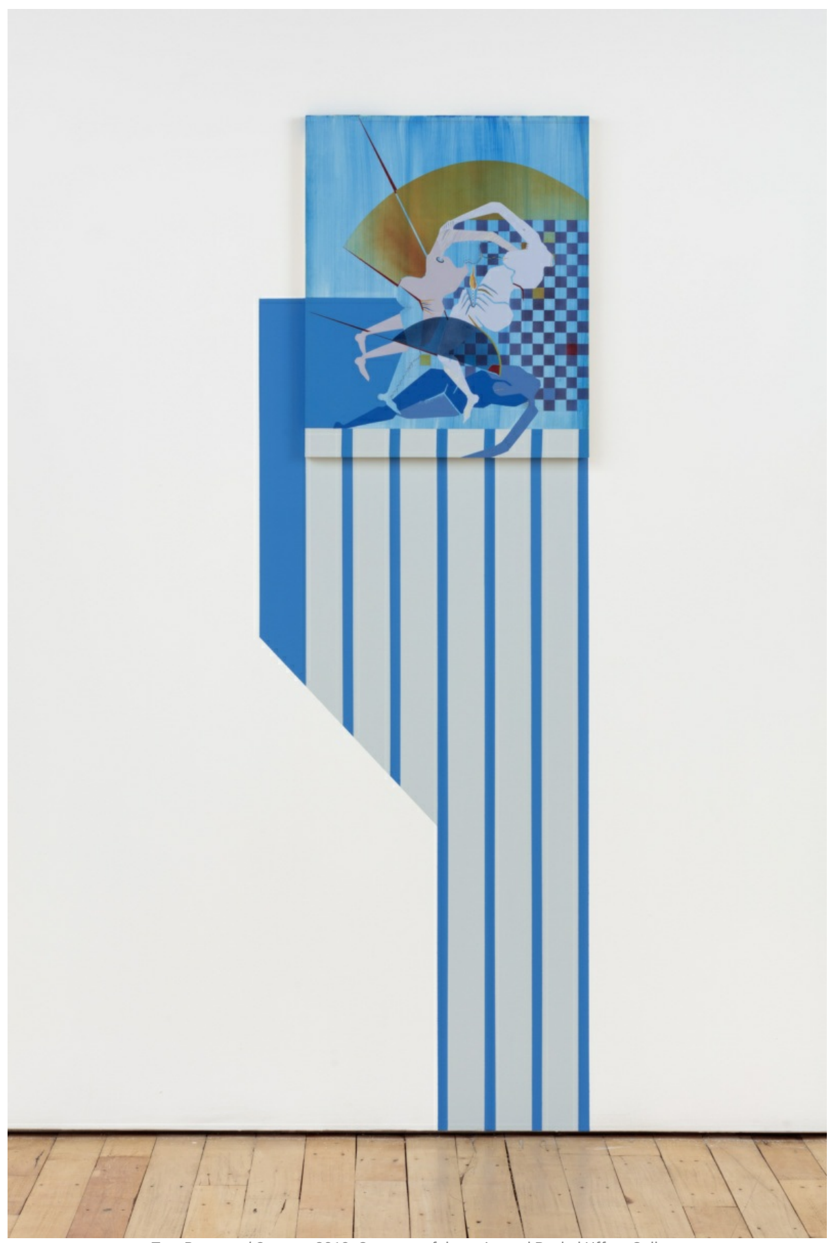
Two Pears and Secrets , 2018.

Hoseini's 2017 solo show "Of Strangers and Parrots" at <u>Rachel Uffner gallery</u> saw the addition of abstract site-specific wall <u>paintings</u>, which flowed into her modestly-sized wood panel works and acted as bodily support columns for the smaller pieces. In addition to being among the group of artists inaugurating The Shed in spring of 2019, Hoseini's